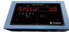
ABS COMBI. CON-10 (LED Control unit)