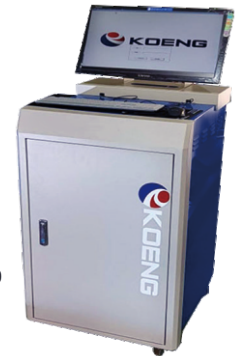
SMART CON-100 (PC control unit)